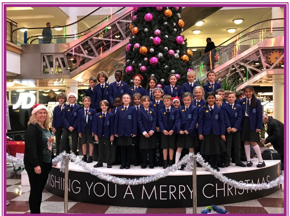
Inspiring children to be independent learners