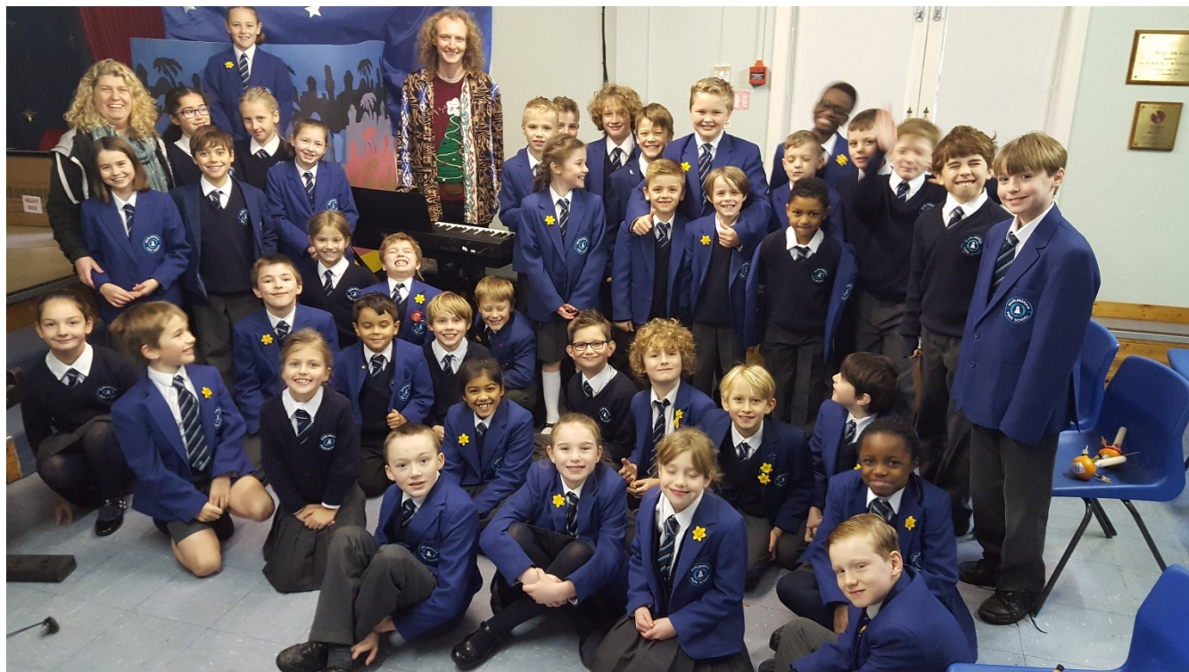
The Juniors, very pleased with the new electric piano