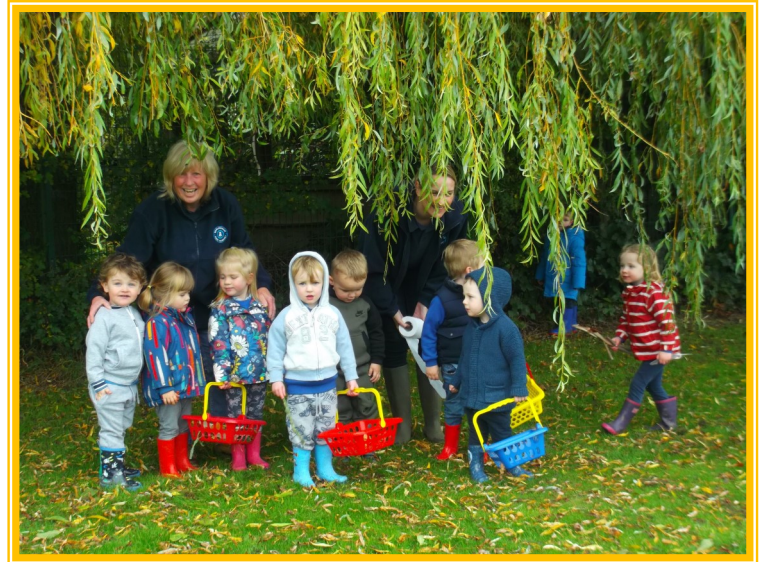
Nursery Autumn walk

In the Nursery we often go on nature walks around the extensive school grounds as we did last week. We collected lots of leaves, sticks and bark. When we got back we all had a turn of looking at, talking about and feeling our 'treasure', before putting some on the wall for our autumn display.