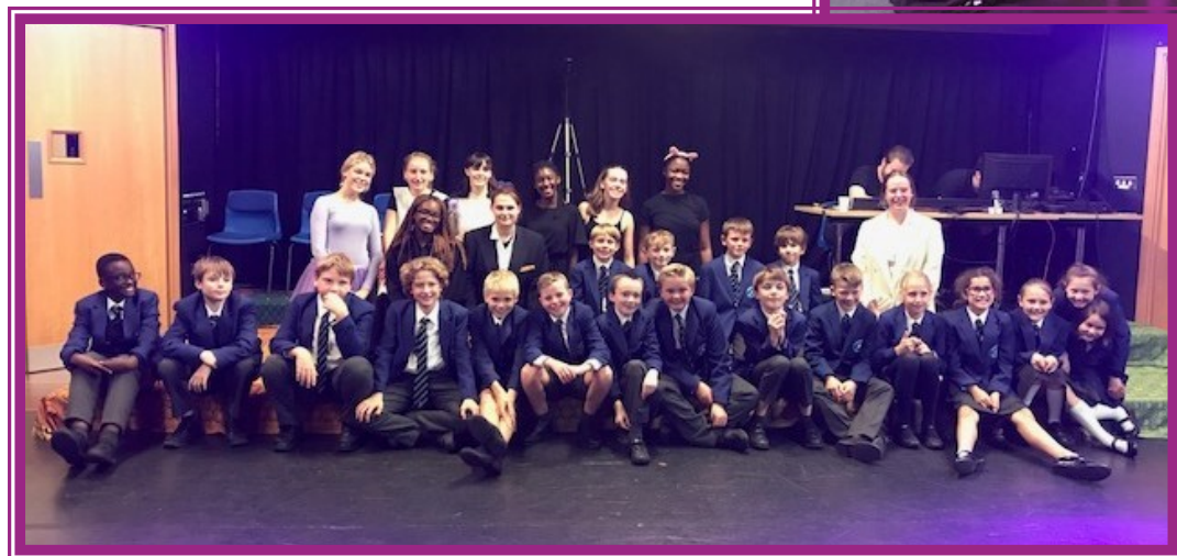
Class 5 and 6 Photo - 'Mixed Up Fairy Tales with a Twist'!